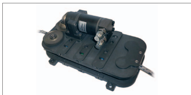
Single fixed pulley

(1) Custom models available for bigger sheet diameter