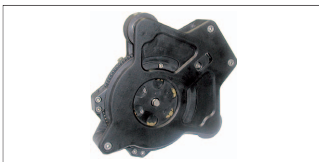
Double fixed pulley