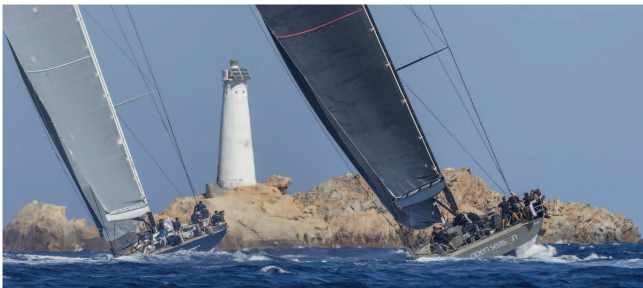
Wally 100 Magic Carpet 3 and Wally 107 Open Season